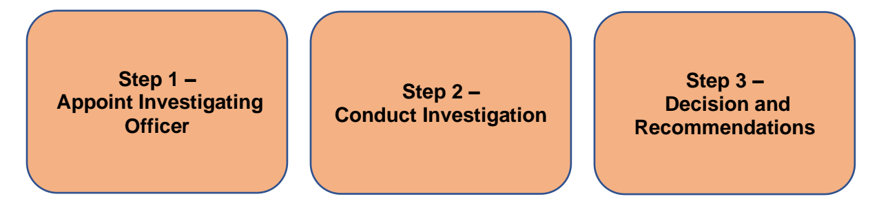
Step 1: Appoint Investigating Officer

Where the Employee Relations and Wellbeing team has recommended that a formal investigation is appropriate, an Investigating Officer will be provisionally identified from a pool of trained investigators (list held by the Employee Relations & Wellbeing team).